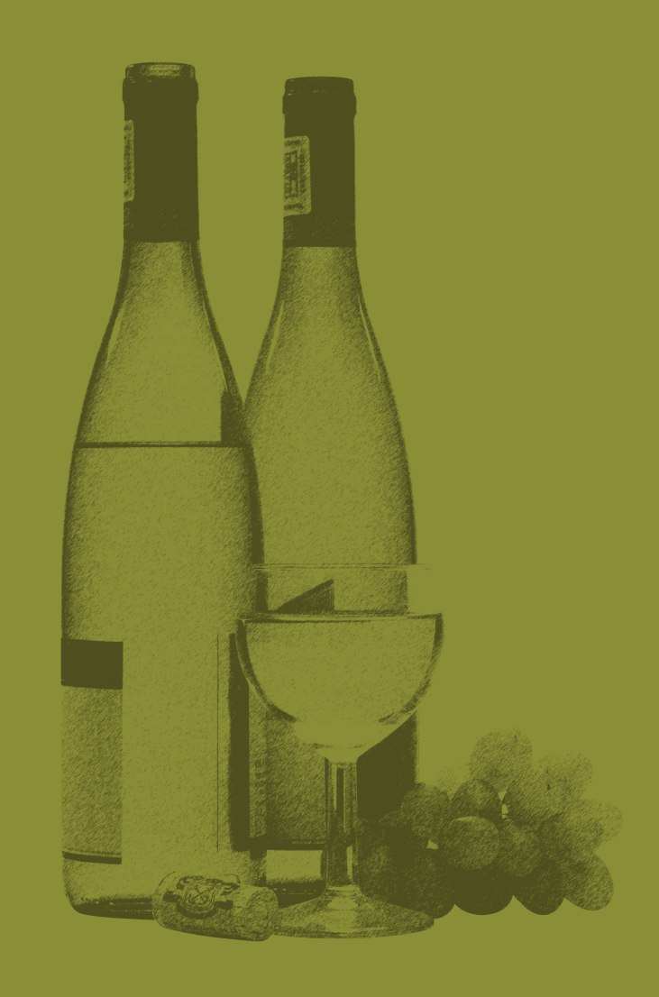
DRINKS & WINES